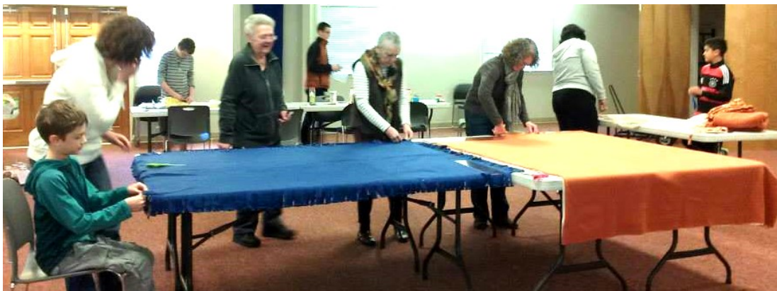
Left: Working on fleece blankets.