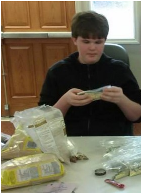
Above: Assembling spices for bean soup