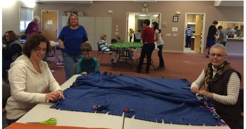
Tying fleece blankets for Lutheran World Relief.

3 people practiced crocheting with Plarn.