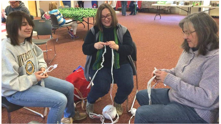
We learned how to crochet with PLARN to make mats for the homeless